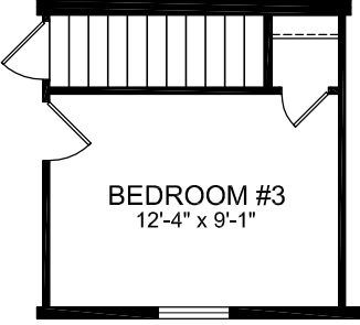
OPT. BASEMENT ENTRY